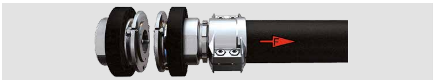
ABV series after emergency separation.