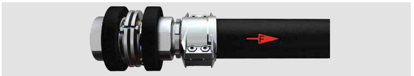
ABV series before emergency separation.

In contrast, with lateral tensile forces the load is unevenly distributed to the breaking pins. The greater the angle to the coupling axis, this is all the more true. The load then increasingly focuses on one or max. 2 pins, so that the planned separation takes place at a lower threshold value.