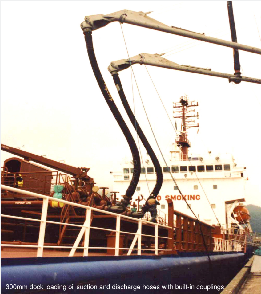
300mm dock loading oil suction and discharge hoses with built-in couplings

A single ply of breaker fabric reinforces the lining and multiple plies of high strength synthetic tyre cord surrounds single or twin fully embedded high tensile steel wires. Hoses are supplied electrically continuous or discontinuous.